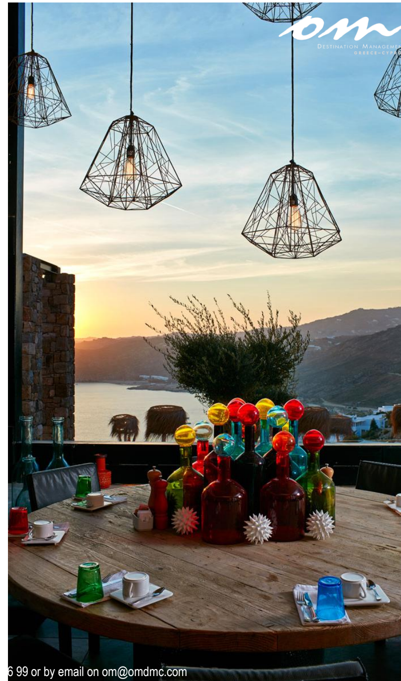
6 99 or by email on om@omdmc.com