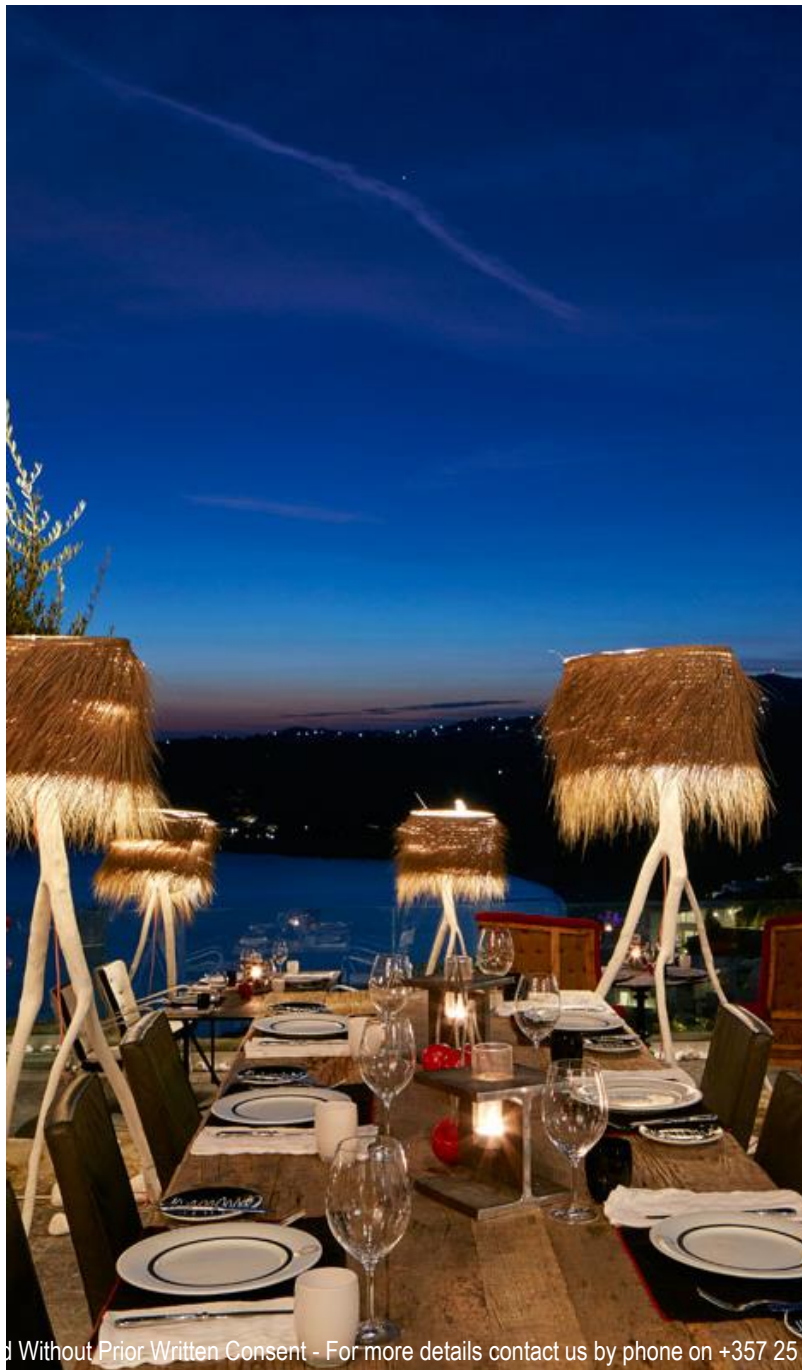
Without Prior Written Consent - For more details contact us by phone on +357 25 36 99 or by email on om@omdmc.com