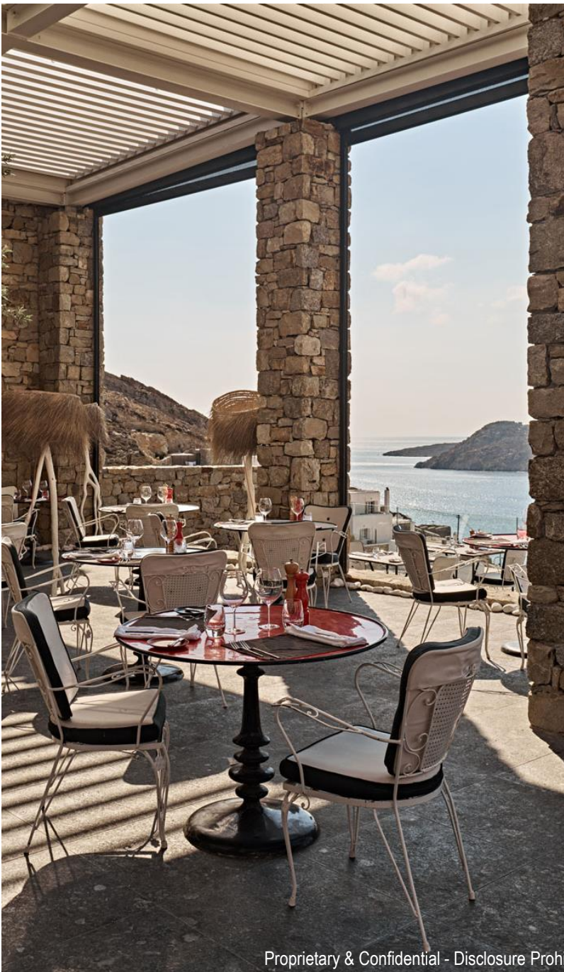
Proprietary & Confidential - Disclosure Prohibited